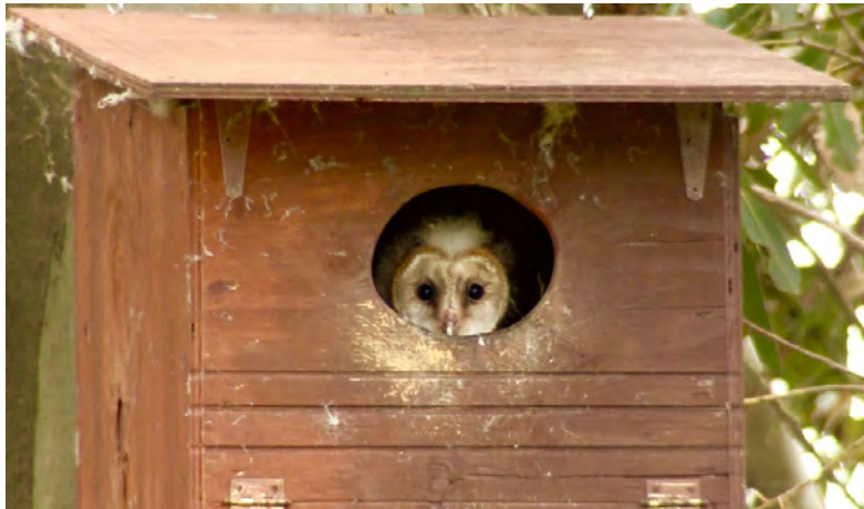
Baby Barn Owl looks out at its future world –Ellis Creek. File Photo

The photo below shows Docent Len Nelson cleaning out the PWA Barn Owl box at Ellis Creek (situated on the dead eucalyptus tree). The box originally was built and placed on the tree by Docent Andy LaCasse. Erecting and maintaining bird boxes is one of the activities of PWA docents.